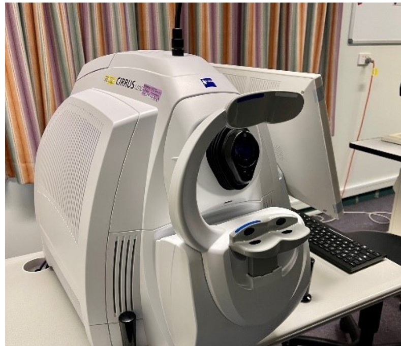
New OCT machine.

“ We are one of the most innovative eye units in NSW, and our clinicians are treating more patients with the latest cutting-edge technology. ”