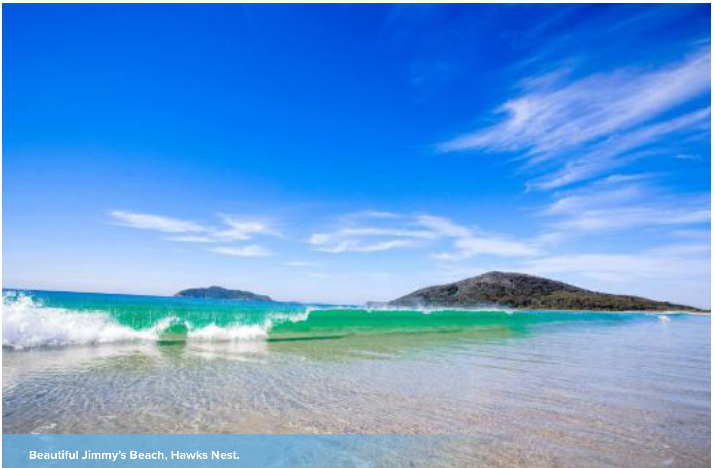
Beautiful Jimmy's Beach, Hawks Nest.

“It was so calming and cosy with everything we needed, and there was lots of space to move around and the proximity to all the amenities was perfect.”