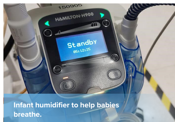
Infant humidifier to help babies breathe.