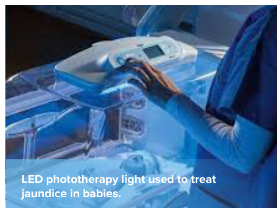
LED phototherapy light used to treat jaundice in babies.

Every donation, no matter how small, helps. If you would like to give, please click here .