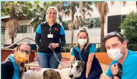
Physiotherapists enjoying time with Gary the Greyhound.