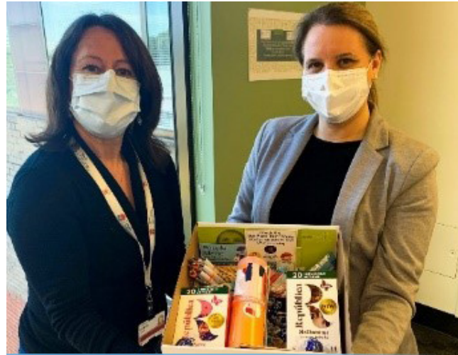
Healthcare staff with their wellbeing hamper including República Organic's premium organic coffee pods.

We are appreciative of República Organic supplying their divine assortment of Organic Certified and 100% biodegradable coffee pods, fairtrade sourced from the coffee producing continents and countries of Guatemala, Columbia, Ethiopia and Timor.